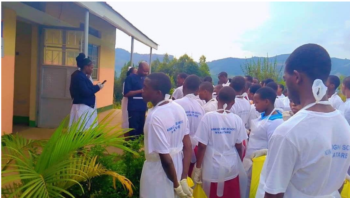
Students of Kinkiizi High School on a compound cleaning exercise.