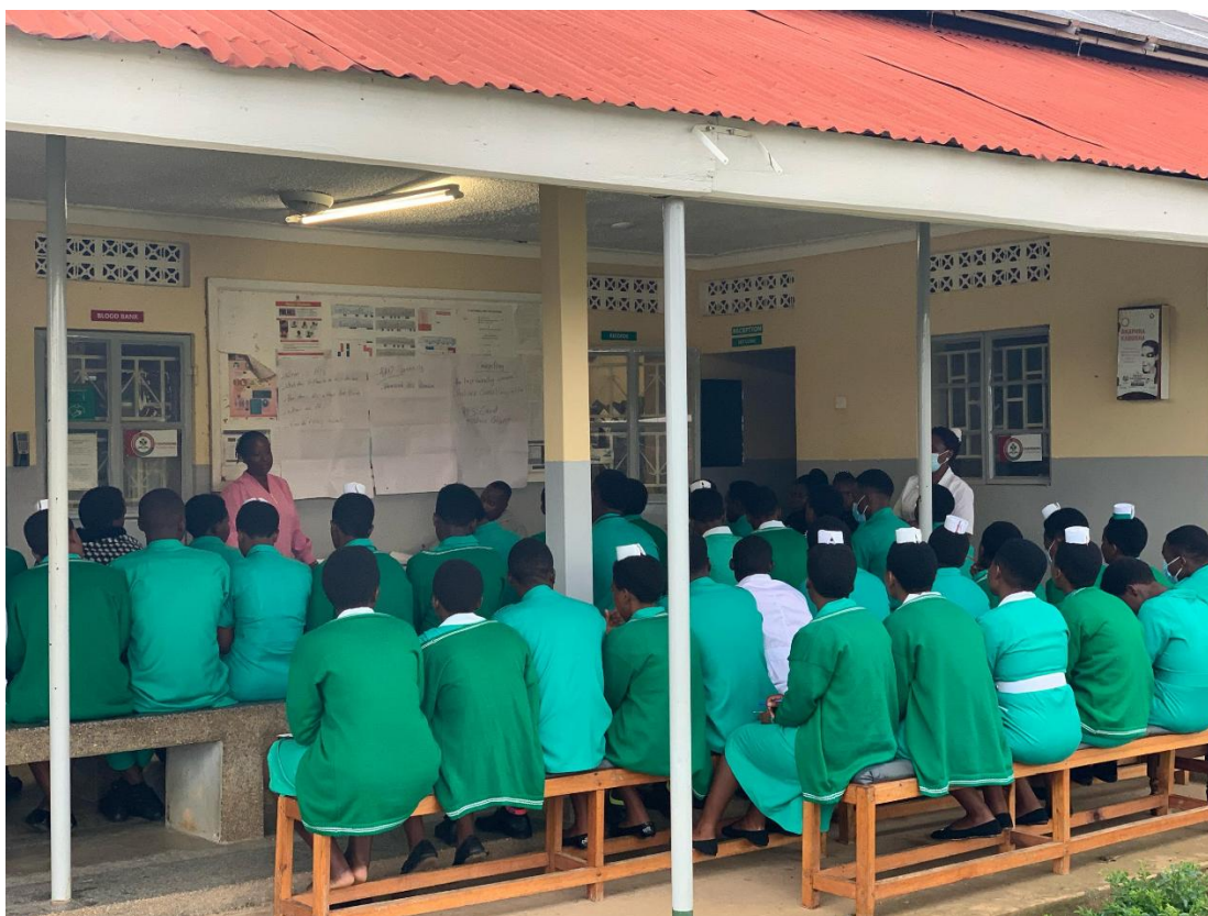
Kisiizi School of Nursing Students attending a CME. Kanungu HC IV is a Uganda Nurses and Midwives' Examinations Board(UNMEB) - certified training and assessment centre.