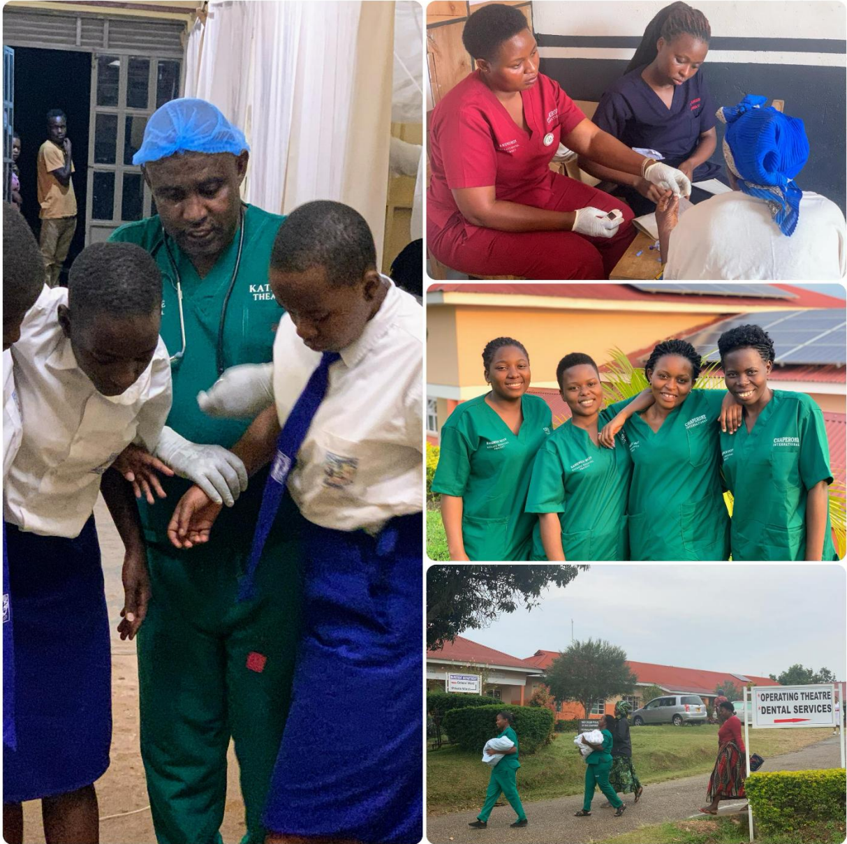
Precious staff: impactful human resources.