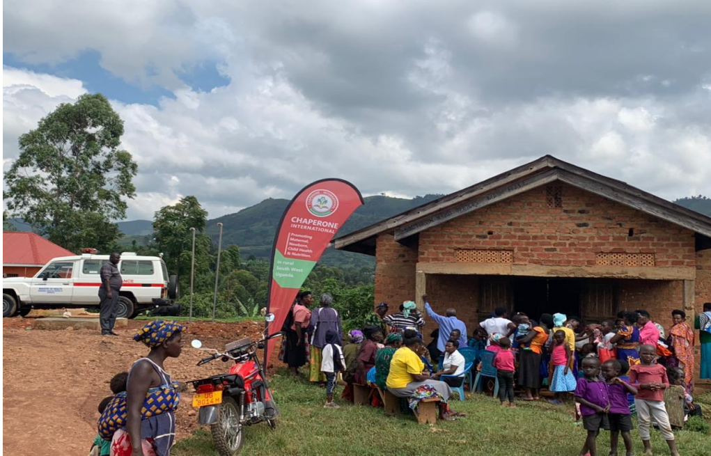
Kanungu HC IV supports 5 outreach sites in Muramba, Omumbuga, Ishaaya, Itembezo and Omukagashe.