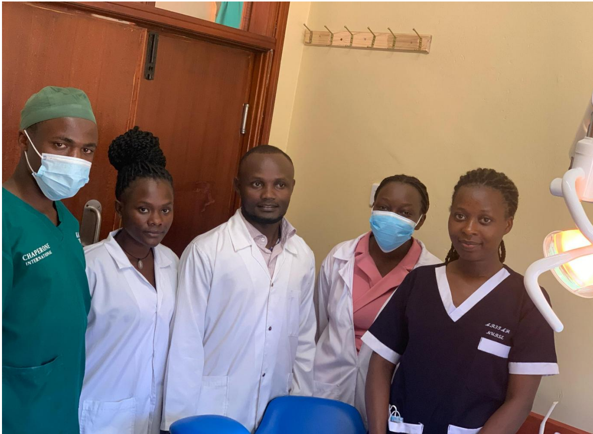
Dentistry departmental staff. The department also hosted 2 trainees from Mengo Hospital and Medicare Health Training College- Kampala.

The department lacks digitalized Dental X-ray, a crucial diagnostic tool to detect and diagnose oral health issues that may not be visible during a routine visual examination such as tooth decay, abscesses, impacted teeth, and bone loss, allowing for early intervention and treatment. Regular dental X-rays can also help prevent more complex and costly problems from developing. In the new quarter, we aim to purchase 1 drum for keeping sterile gauze. We also hope to obtain support to build a new dentistry to solve the space challenge. In future, the department. We have also made strategies for community sensitization, such as;